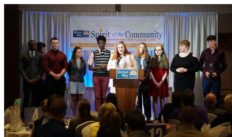
2019 Outstanding Community Collaboration Award: Midland High Drama Club