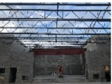
Structural Steel Installation at Adams Elementary