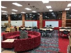
Furniture Delivery at Jefferson Media Center