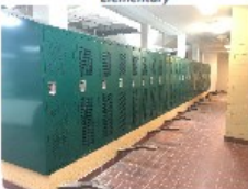
Installation of New Lockers at H.H. Dow High Locker Room