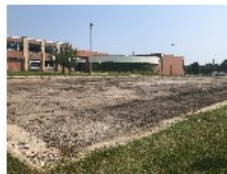
Milling at Midland High Parking Lot