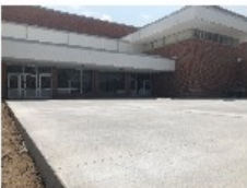
Completed Site Concrete at H.H. Dow High