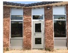
Installation of New Windows at Adams Elementary