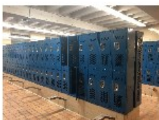
Installation of New Lockers at Midland High Locker Room