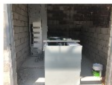
Installation of Switchgear at Adams Elementary