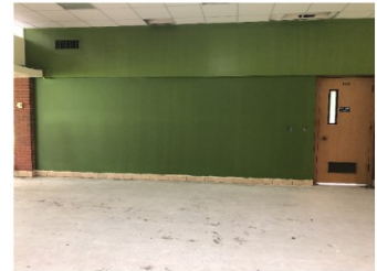
Painting at Northeast Middle School