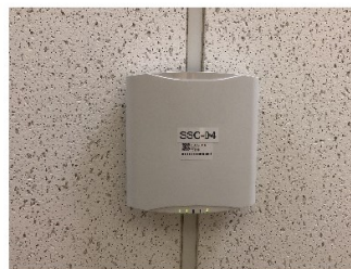
New AP Installation at State St. Building