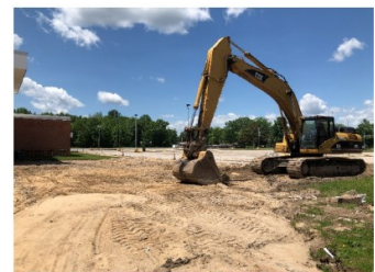
Site Concrete Removal at H.H. Dow High