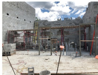
CMU Block Installation at Adams Elementary