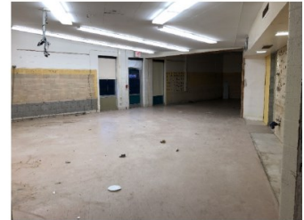
Demo work at Adams Elementary