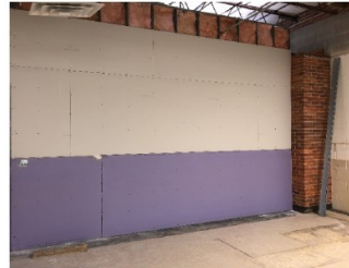
Drywall Install at H.H. Dow High Science Lab