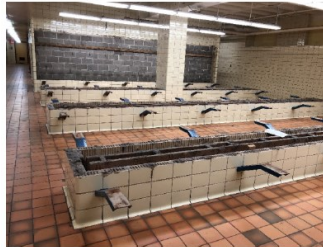
Locker Demo at Midland High