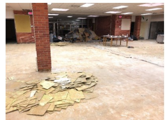
Carpet Removal at Midland High Media Center