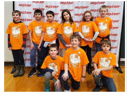
Central Park Beyond the Brick