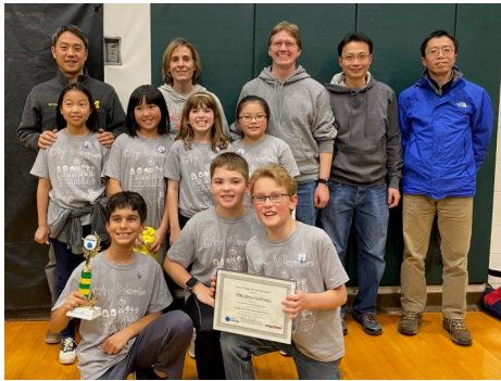
Adams City Warriors