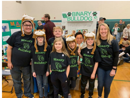
Siebert Binary Bulldogs