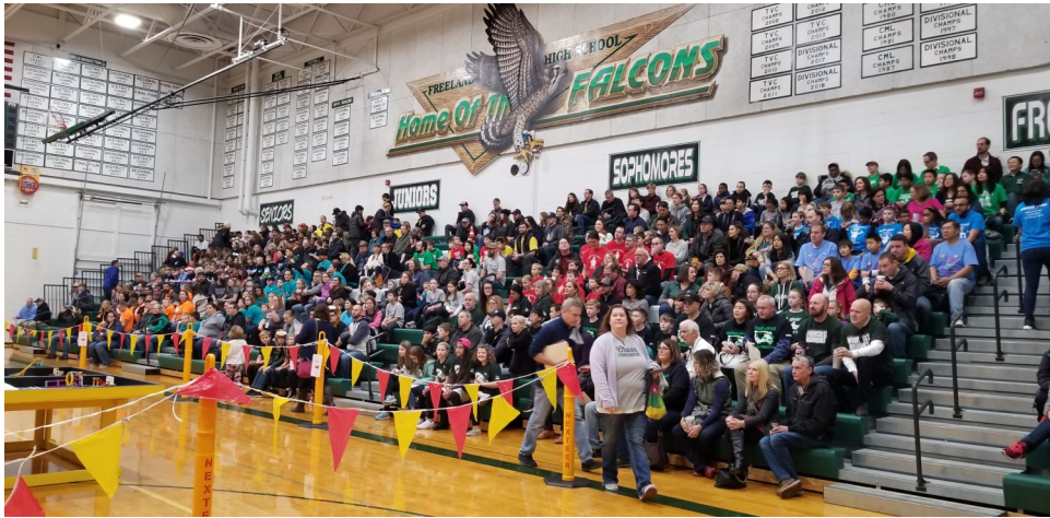
READY, SET, LEGO!