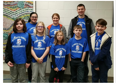
Plymouth Pioneer Programmers