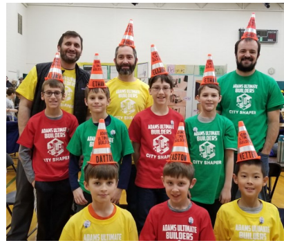
Adams Ultimate Builders