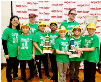
Siebert Bulldog Builders