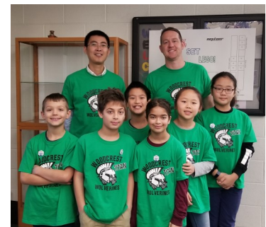
Woodcrest Titan Wolverines