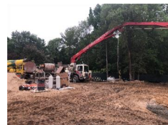
Concrete pump at Siebert