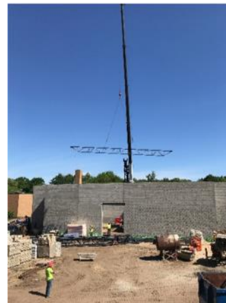
Chestnut Hill steel erection