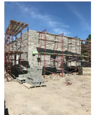
Masonry finished at Woodcrest