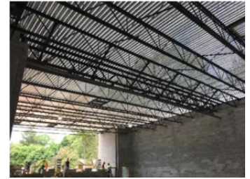
Roof deck complete at Siebert