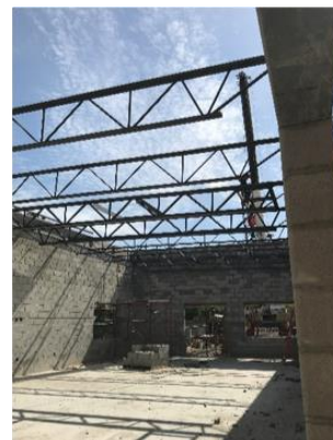
Finished bar joists at Woodcrest