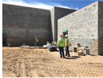
Chestnut Hill masonry installation