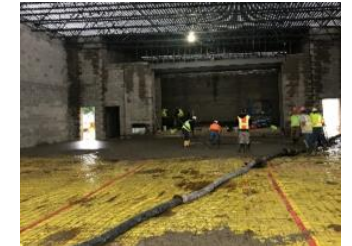
Concrete placement at Siebert