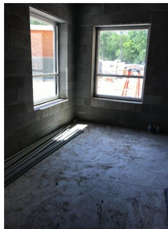
Windows installed at Siebert addition