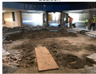
Chestnut Hill maker space after sand leveling