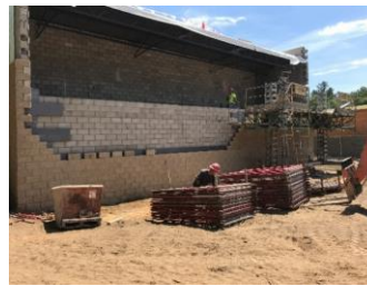
Siebert addition nearly enclosed