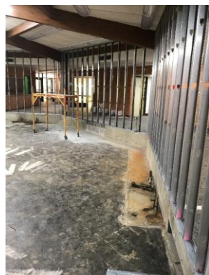
Steel studs installed at Siebert