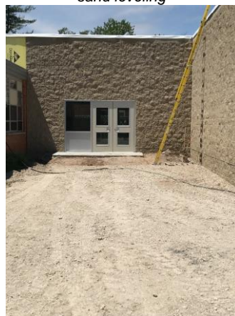
Exterior view of new doors at Siebert