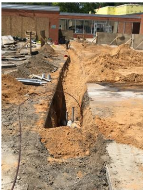
Electrical work at Siebert