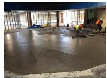
Chestnut Hill maker space concrete placement