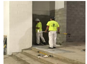
Interior walls painted at Siebert addition