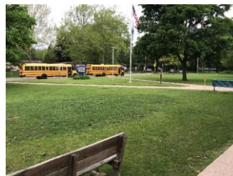
Previous Chestnut Hill parking