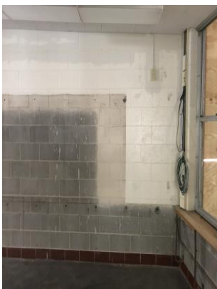
Painting of existing classrooms at Siebert