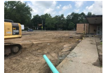
Current Chestnut Hill parking