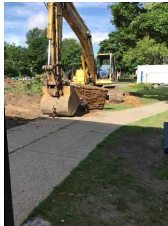
Slab excavation at Chestnut Hill