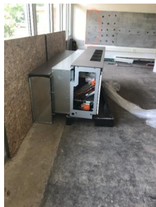
Mechanical unit at Chestnut Hill