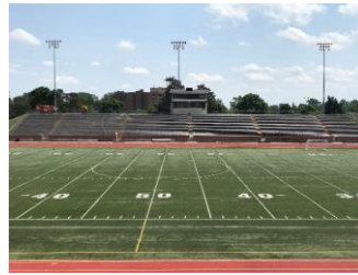
Midland High Football Stadium bleachers before soil stabilization