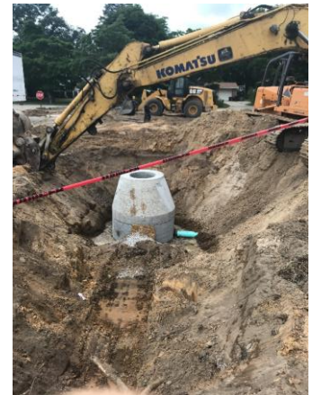
Storm structure installed at Chestnut Hill