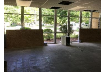
Window frame and glazing installation at Chestnut Hill