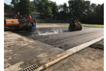
Asphalt paving at Woodcrest