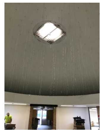
Chestnut Hill sound batters preparation