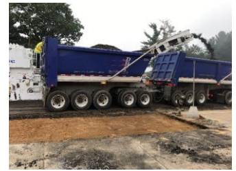
Siebert parking lot asphalt launched into truck to be milled