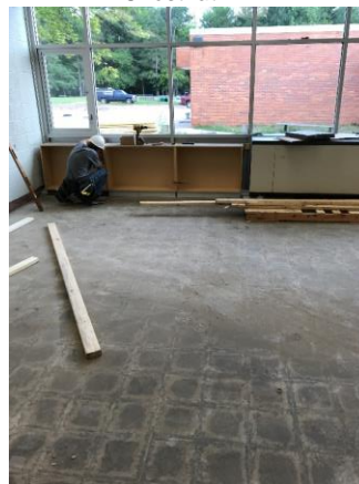
Casework installation at Siebert