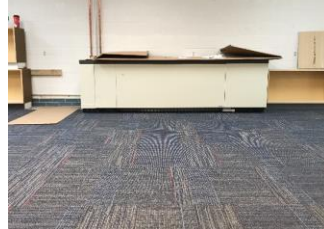
Unit ventilators placed at Chestnut Hill