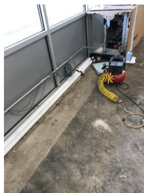
Unit ventilator copper piping insulated at Siebert