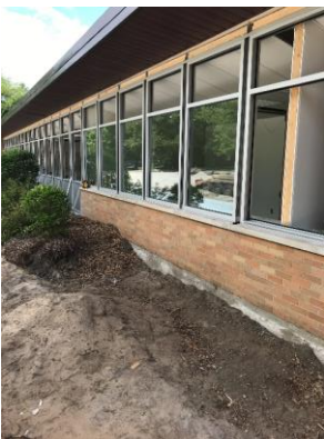
Glazing installed at Chestnut Hill