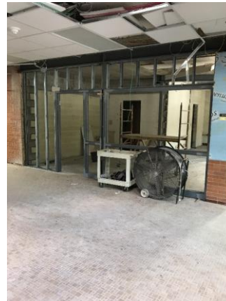
Siebert main office frame installed