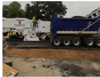
Milling at Siebert parking lot