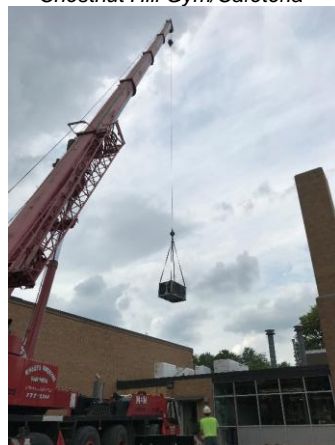
Crane Lifting Air Handling Units at Chestnut Hill