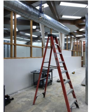
Ductwork installation at Siebert Maker Space