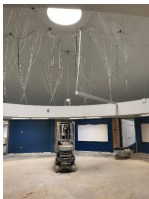
Lighting Installed at Chestnut Hill Maker Space