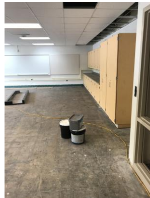
Chestnut Hill Art Room Ready for Flooring