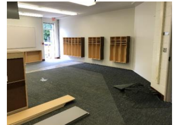
Cubie installation at Siebert