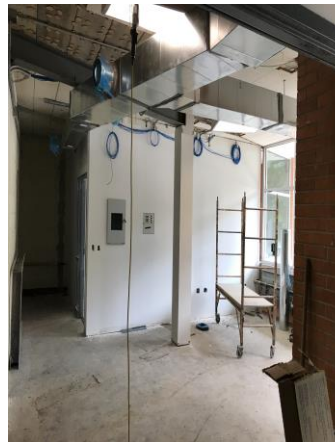
New Office Renovations at Siebert