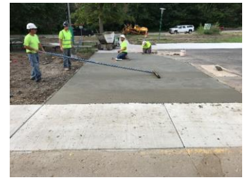
Sidewalk Placement at Siebert