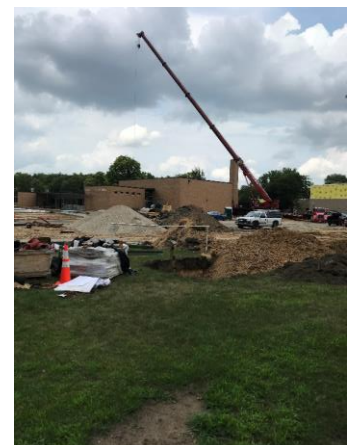
View of Crane from Chestnut Hill Road