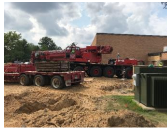
Crane Set Up at Chestnut Hill